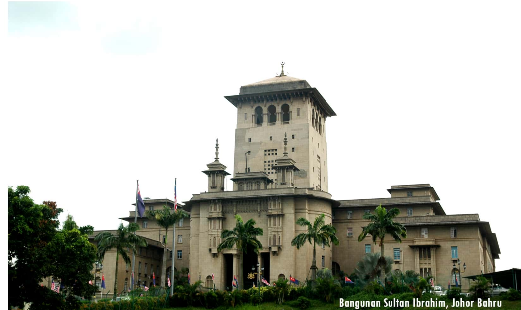
Bangunan Sultan Ibrahim, Johor Bahru

This program is intended for any levels of students who wants to learn more about Malaysian Architecture and Culture. The program offers an experience on one of the richest components of Malaysia's cultural heritage, which is the architecture. Study trips will cover four states in the west coast of Peninsular Malaysia. Selected project and designer will be chosen as case study.