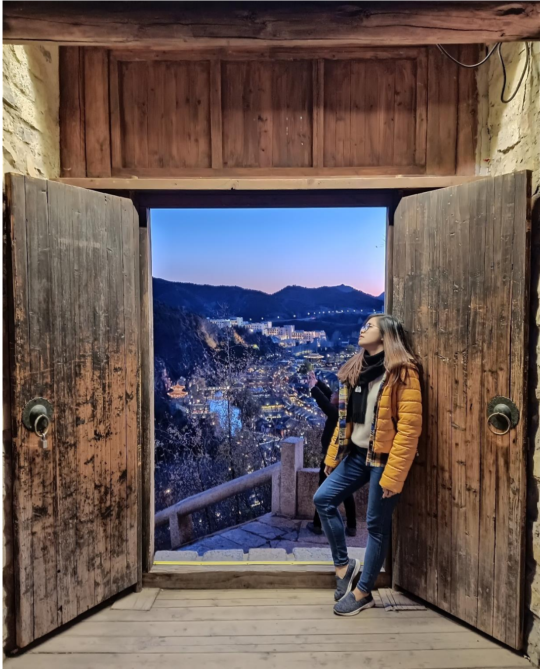
Figure 5: Visit to Gubei Water Town.