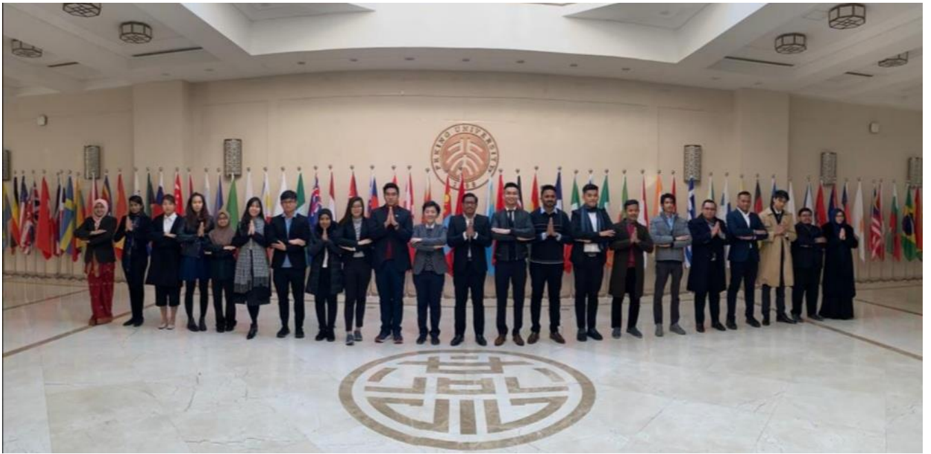
Figure 6: Heart by heart, hand in hand gestures.