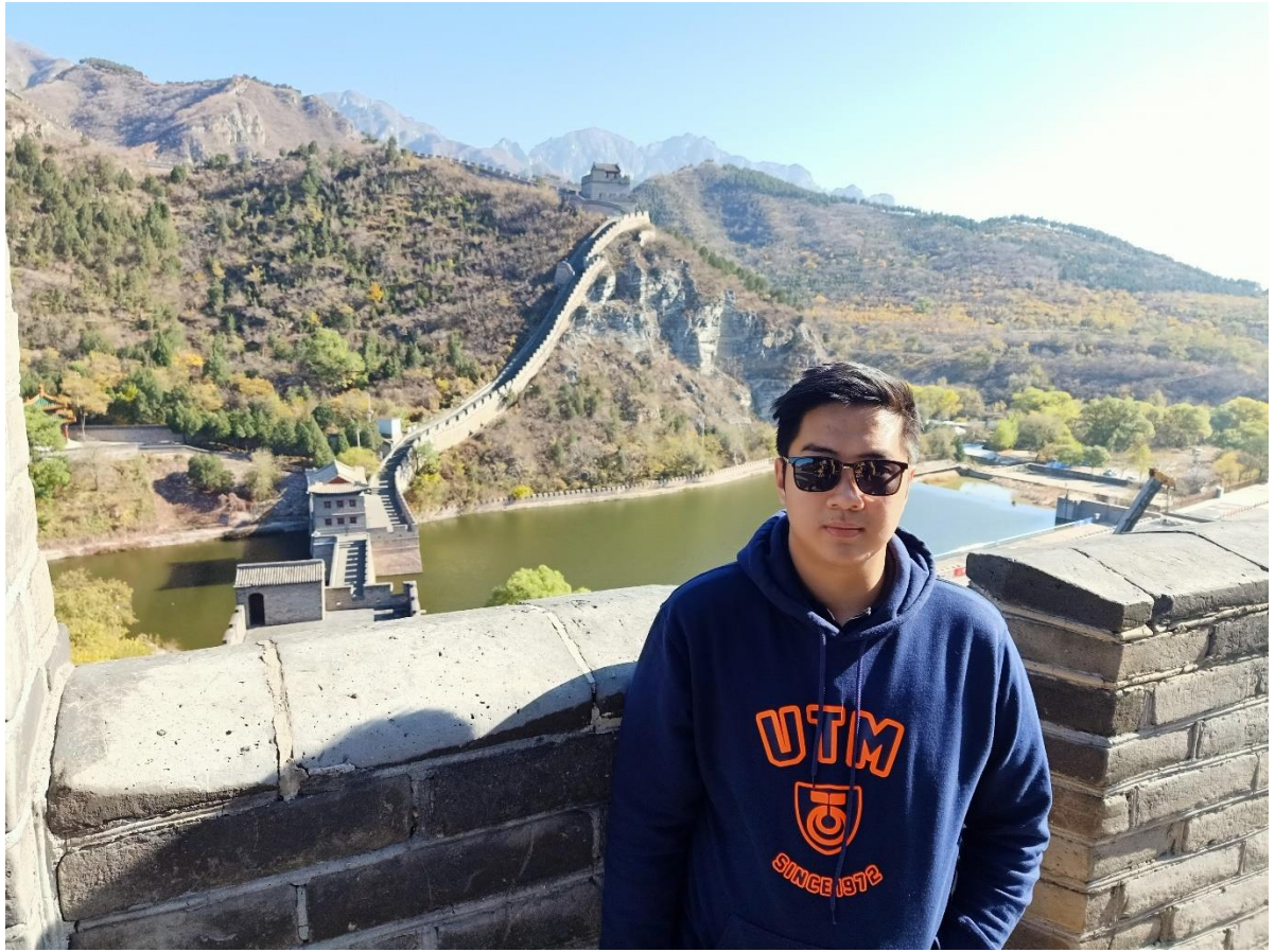
Figure 4: Visit to The Great Wall.