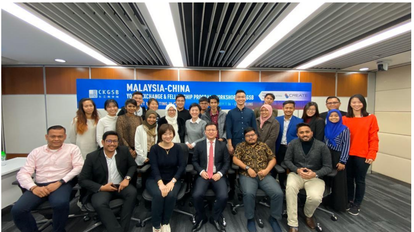
Figure 7: Visit to Cheung Kong Graduate School of Business.