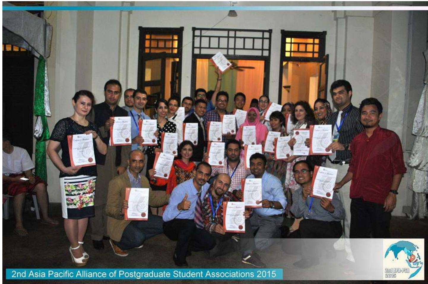
2nd Asia Pacific Alliance of Postgraduate Student Associations 2015